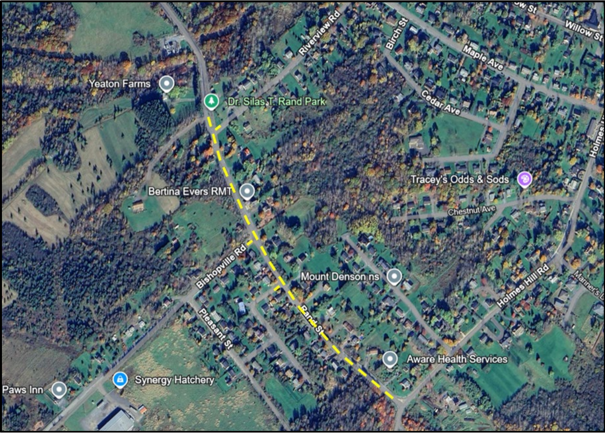
Figure 1-1. Project Location