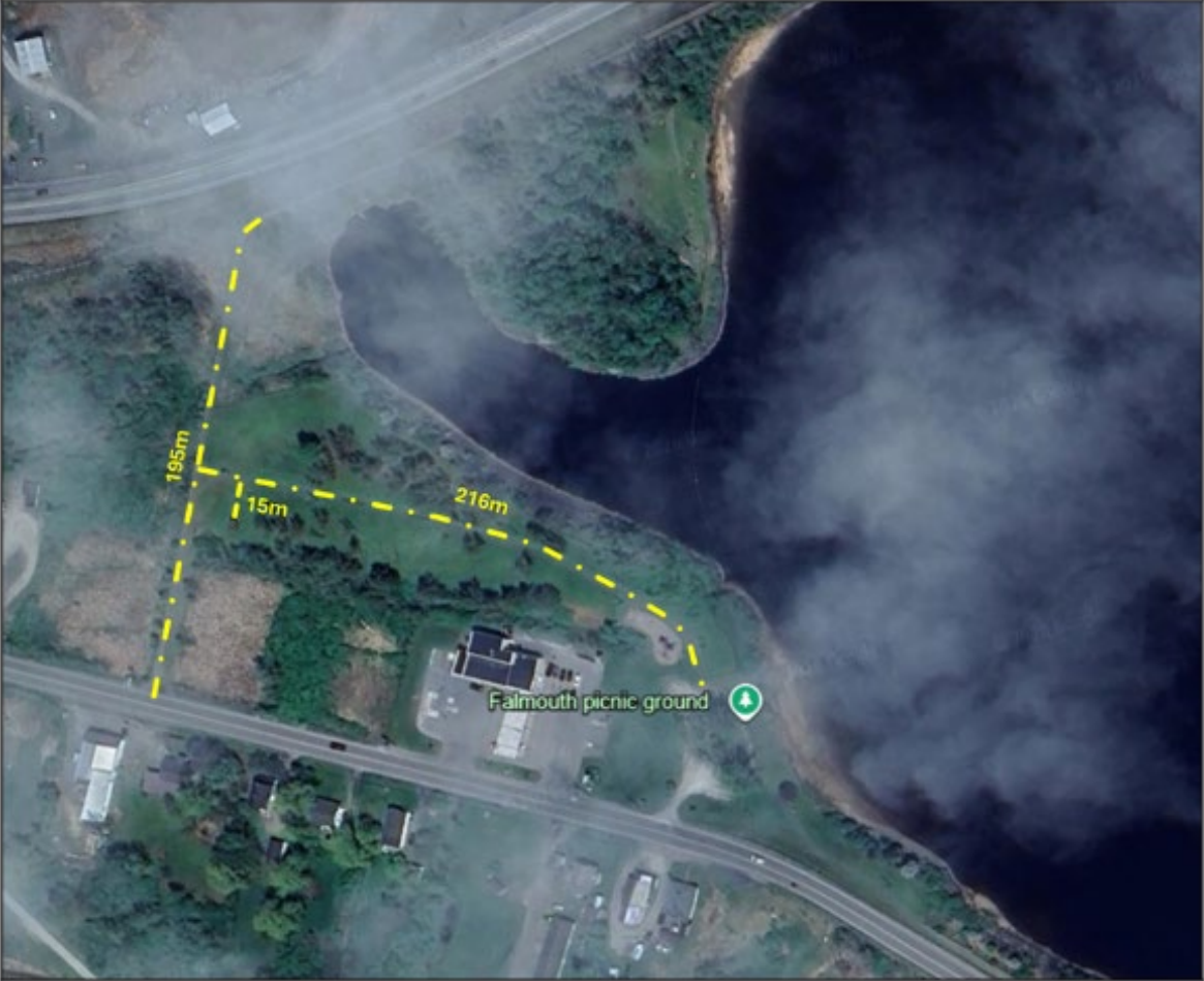
Figure 1. Replacement Sections Along Falmouth Causeway Trail

hazard for trail users. The new sidewalk/trail will be 1.8m wide to meet updated accessibility standards and will be constructed out of concrete, for increased durability and a longer lifespan.