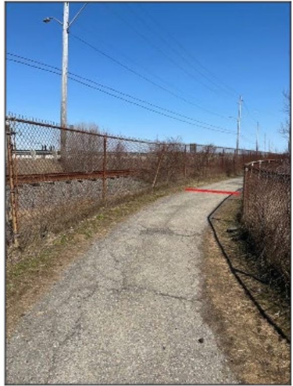
Figure 3. Ending Point at Causeway