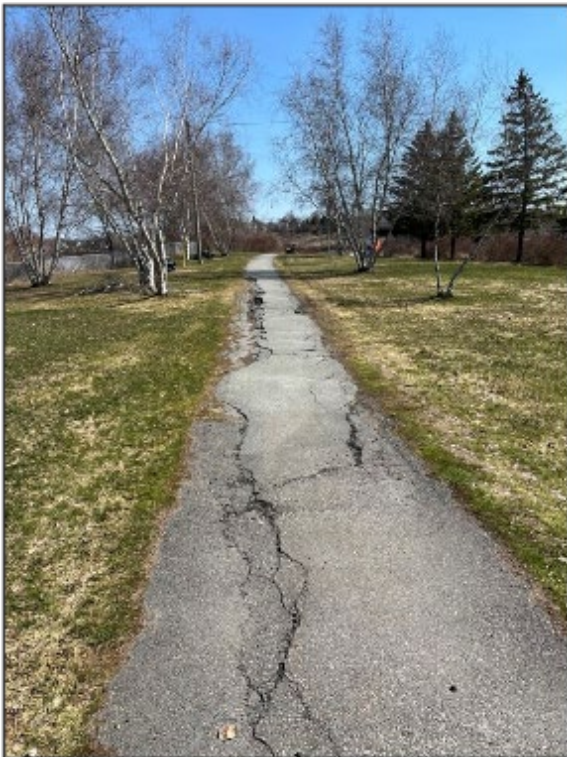
Figure 4. Example of Existing Condition