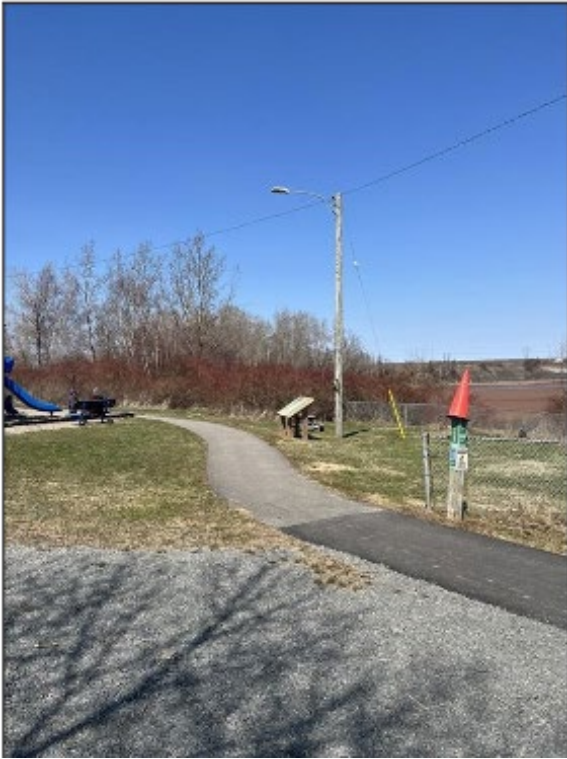
Figure 2. Starting Point at Boat Launch