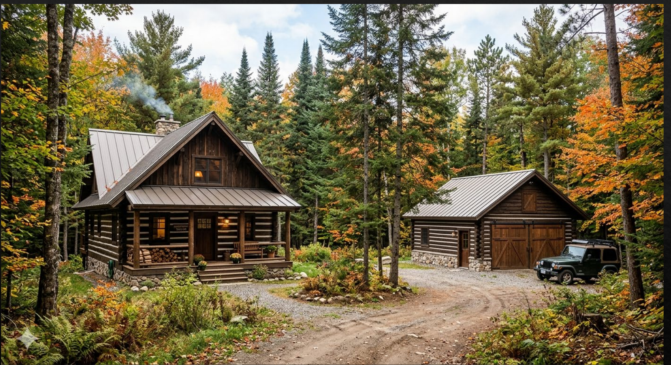
AI generated photo