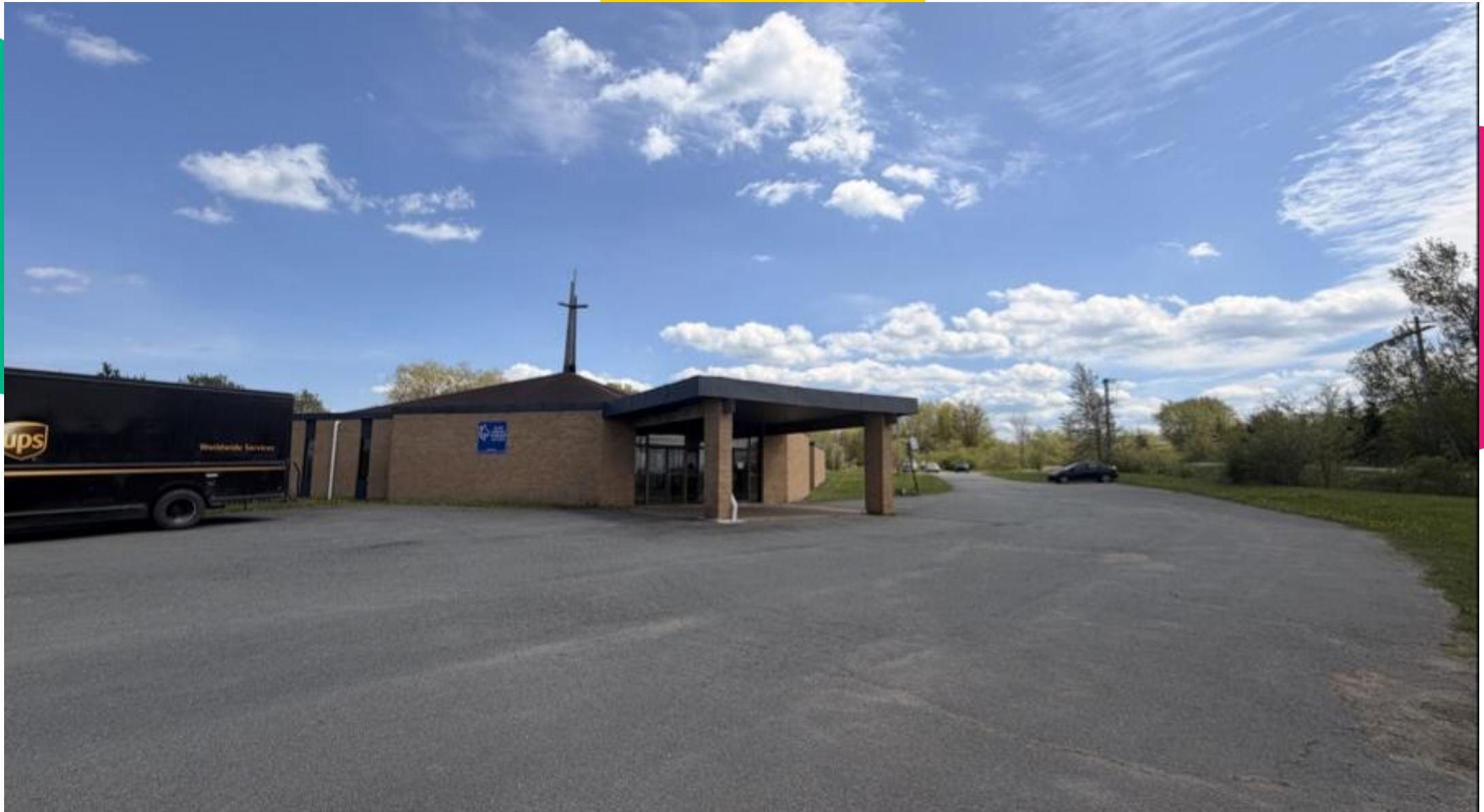
View of the subject lot from Highway 14