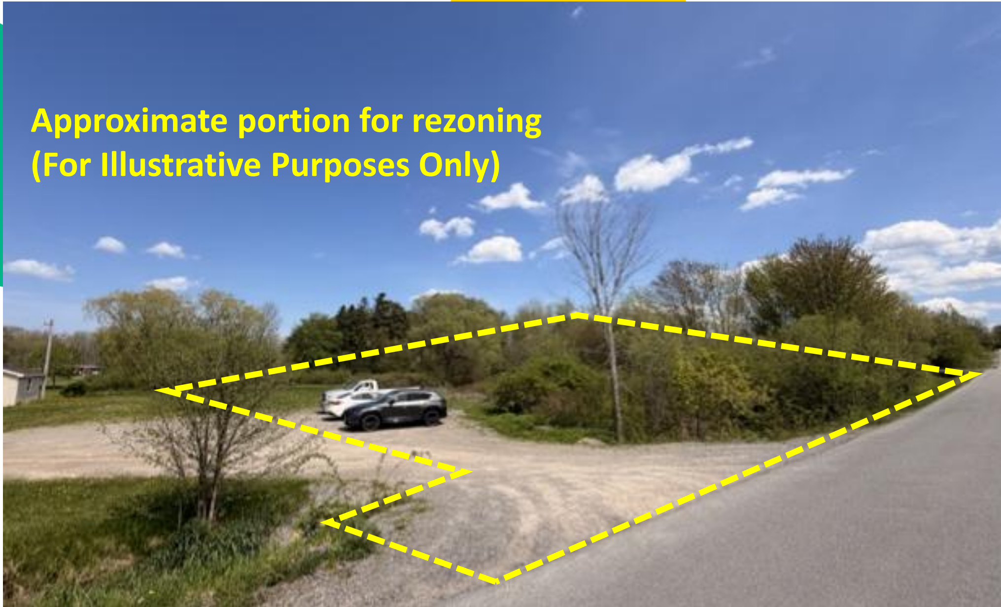
View of the subject lot from Dill Road

Approximate portion for rezoning (For Illustrative Purposes Only)