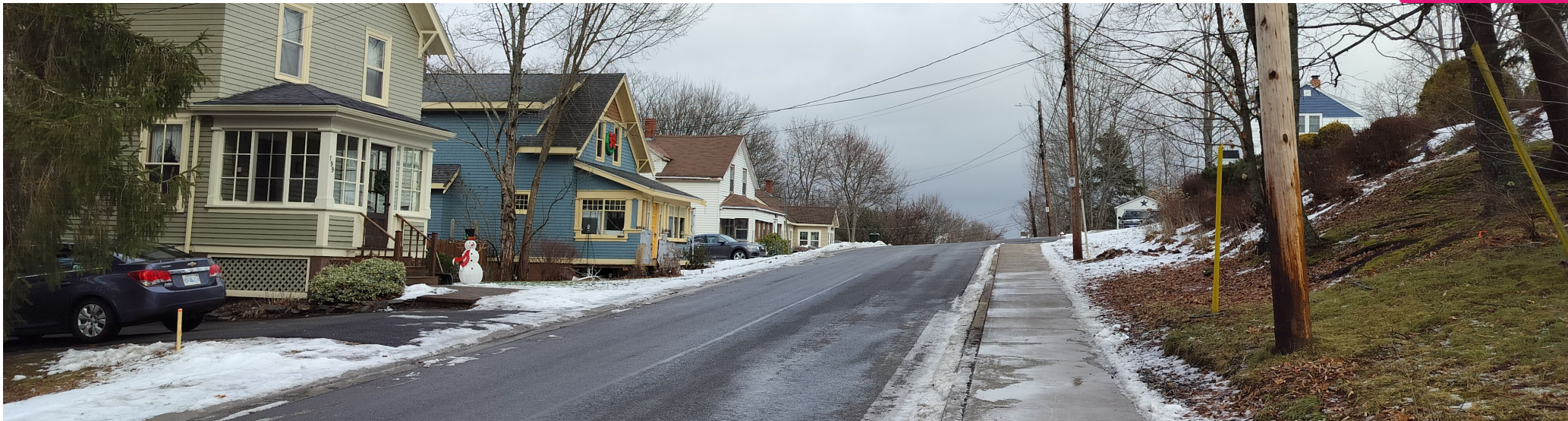
View of Surrounding Area on Alexander Street