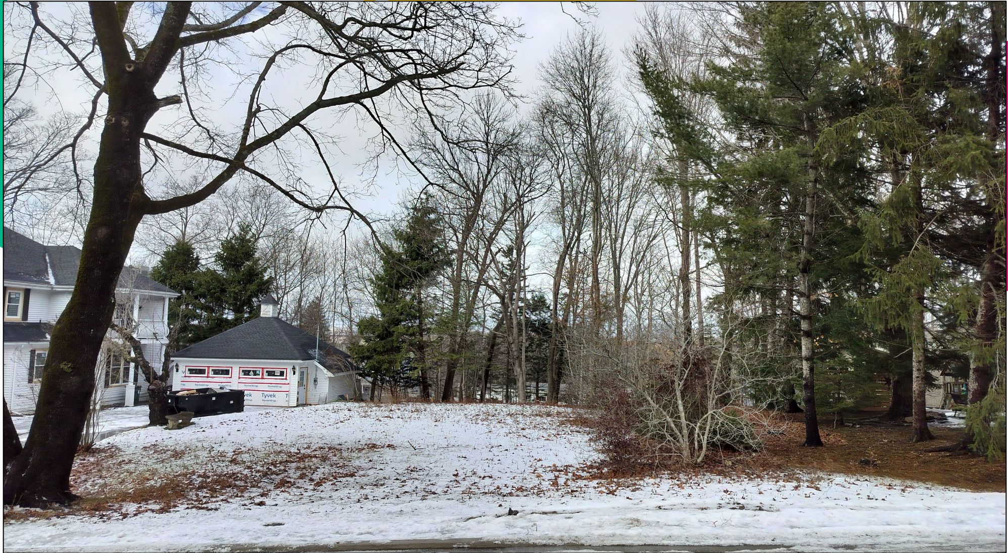
View of Subject Lot from Alexander Street