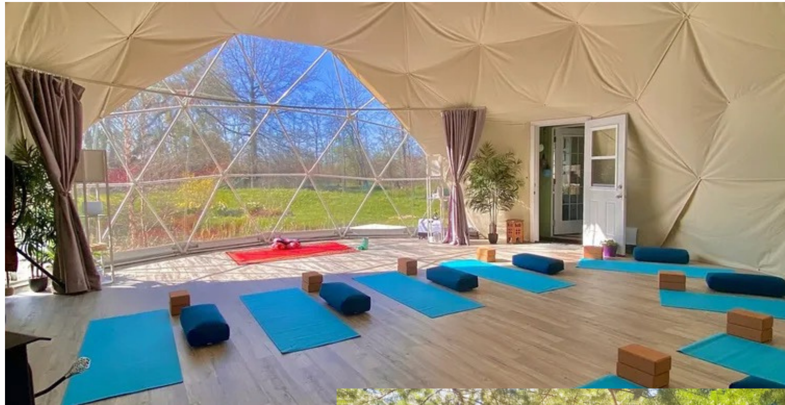
Sample photos of what our yoga dome will look like.