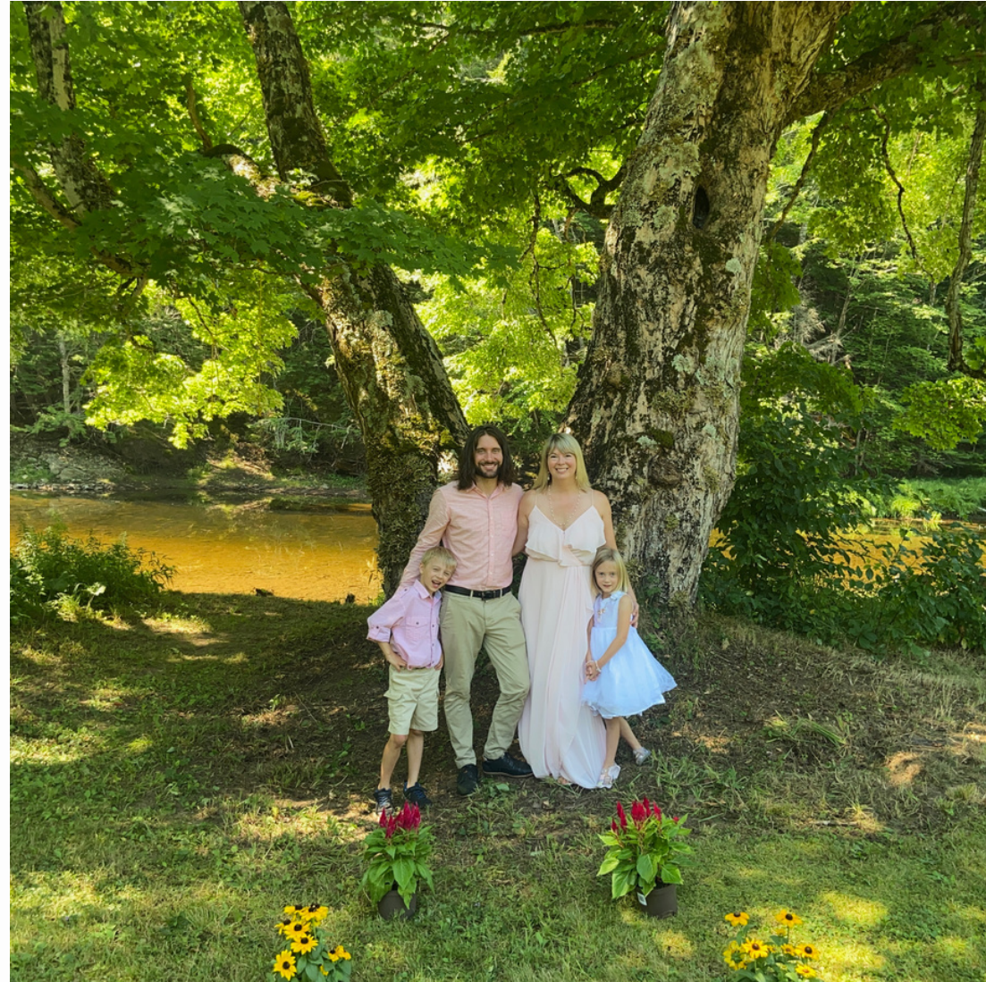
Renewing our vows next to the Herbert River.