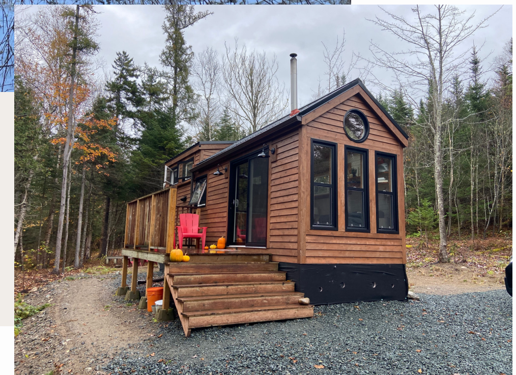
Tiny Home we visited in St. John, NB