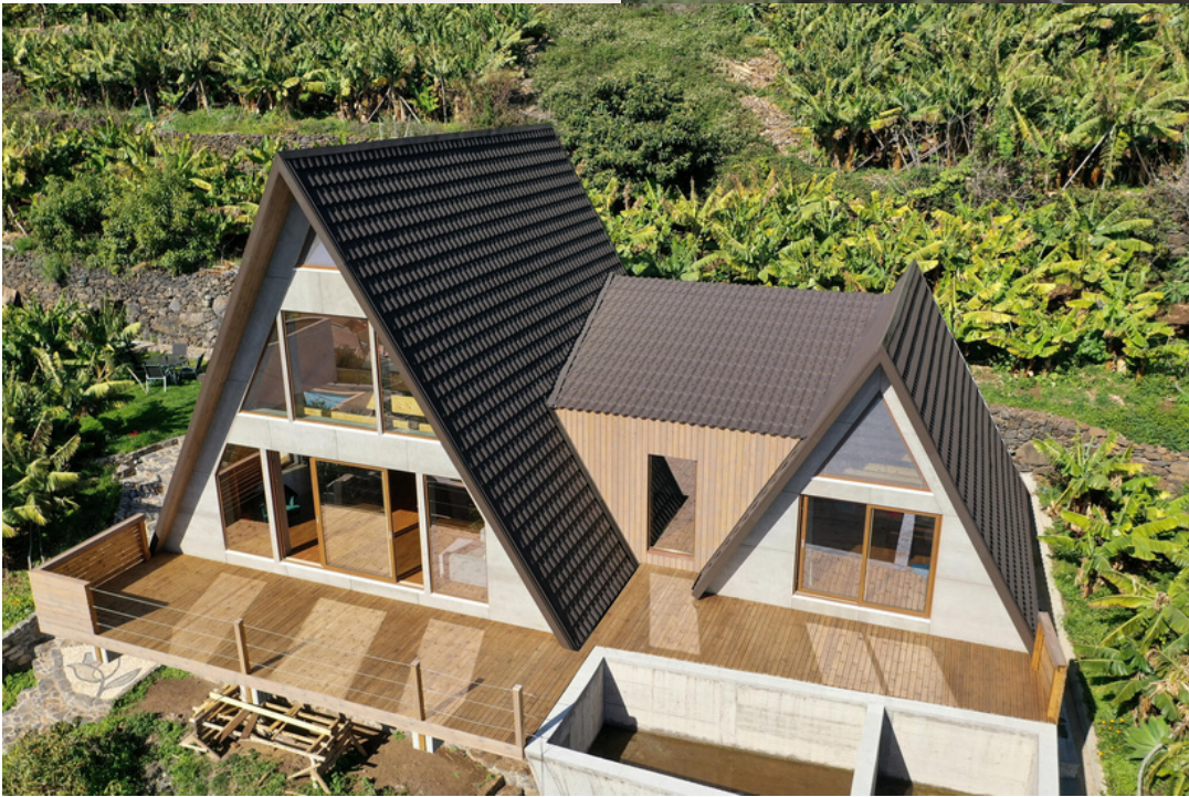
Example site map and example lodge/cabins for our second phase of opening.