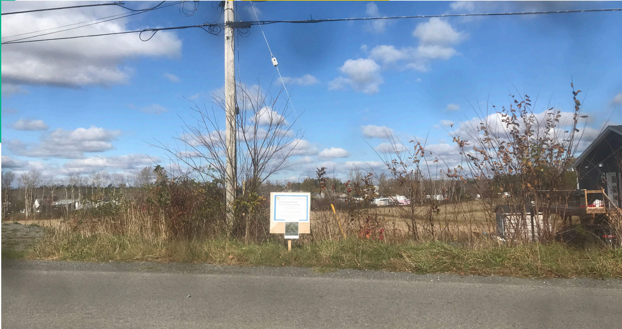
View of Subject Lot and Posted Signage