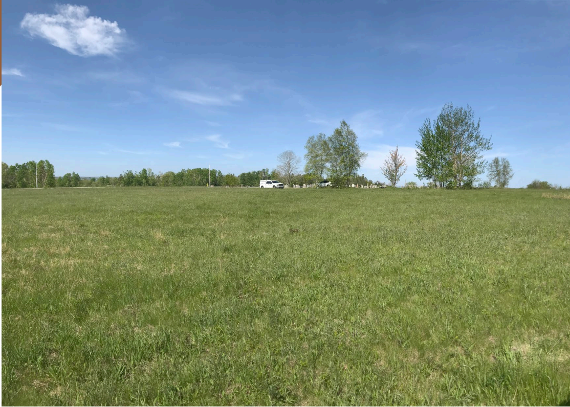
View looking back towards Highway 215