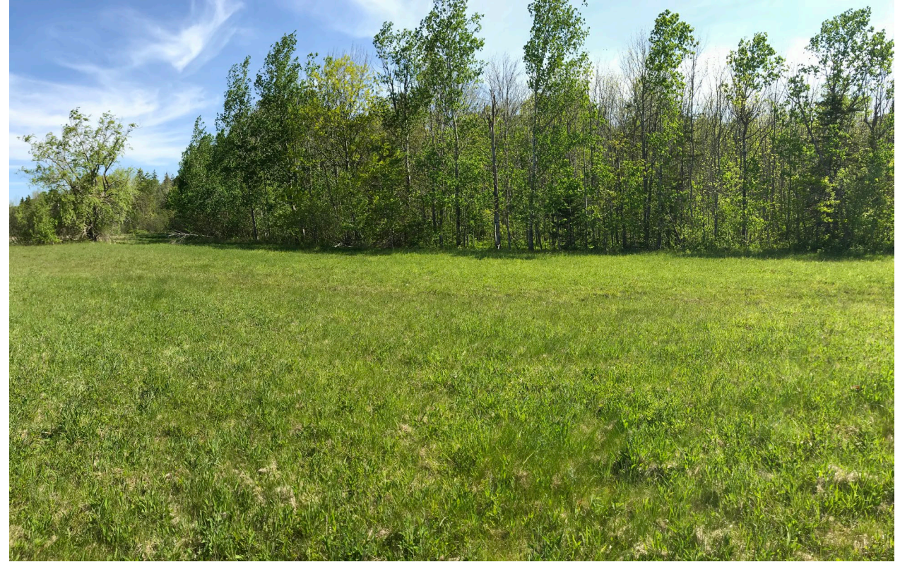
Field / woods ball location