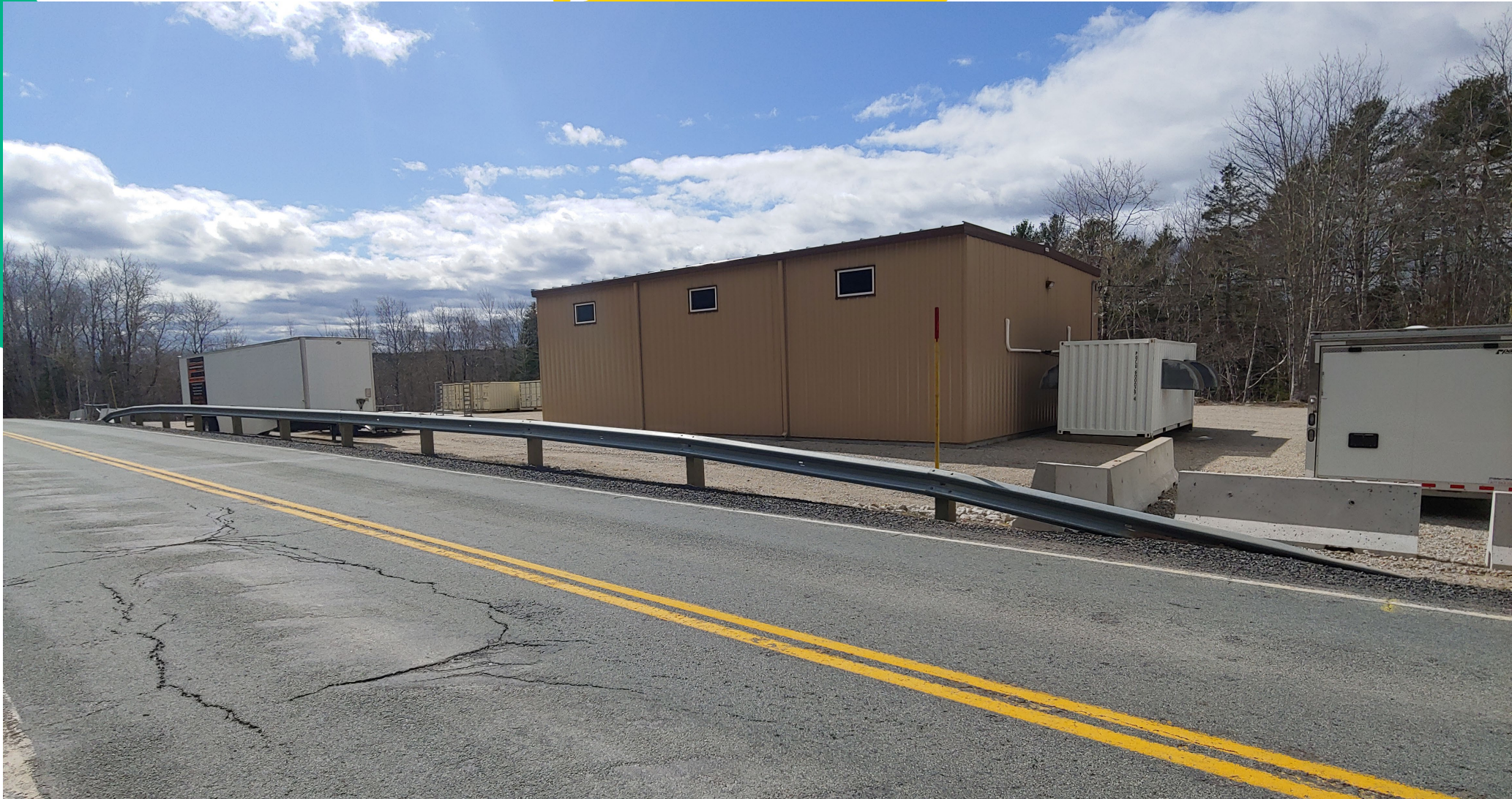
View of Subject Lot from Highway 14