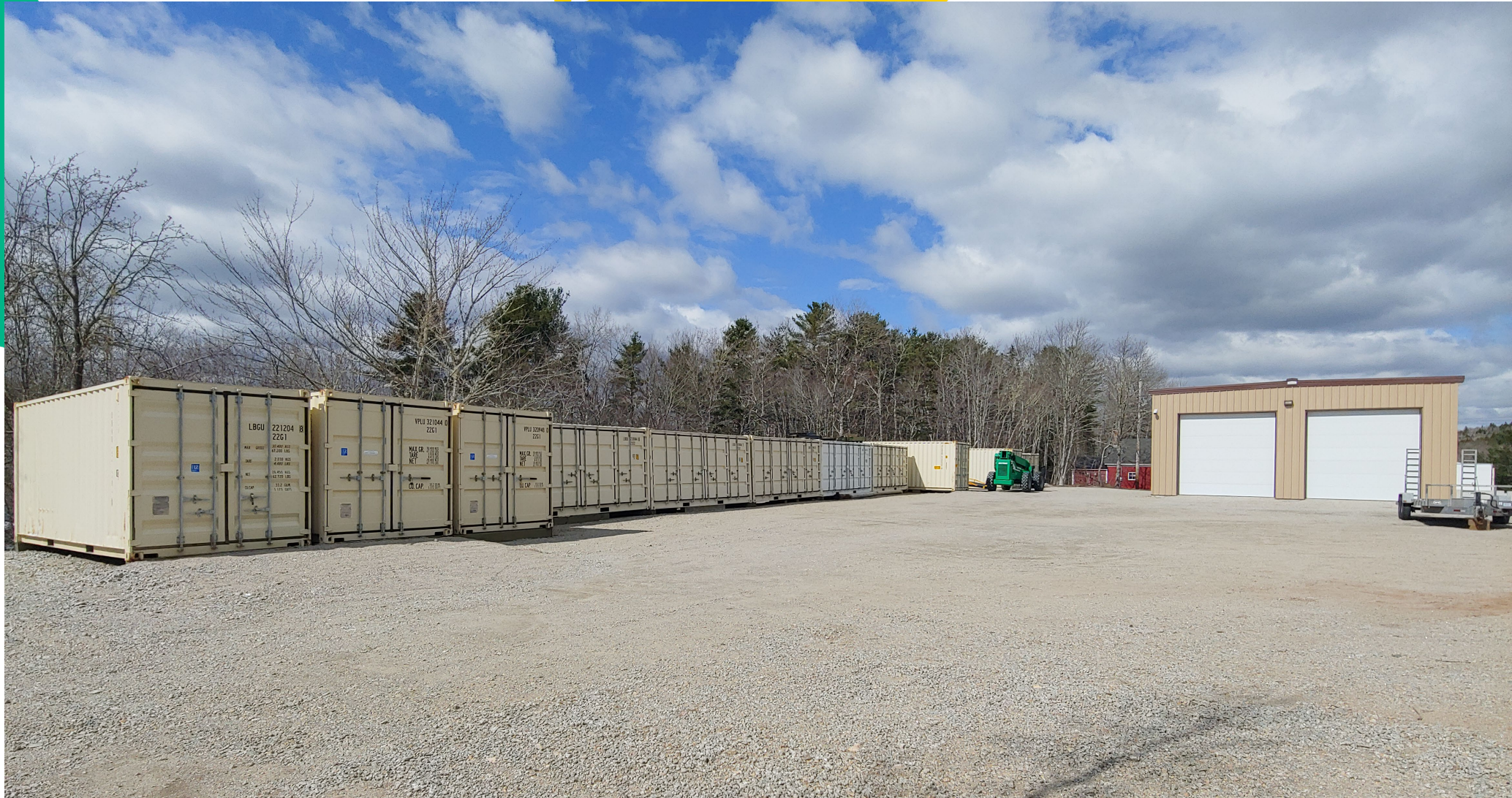
View of Subject Lot from front access point