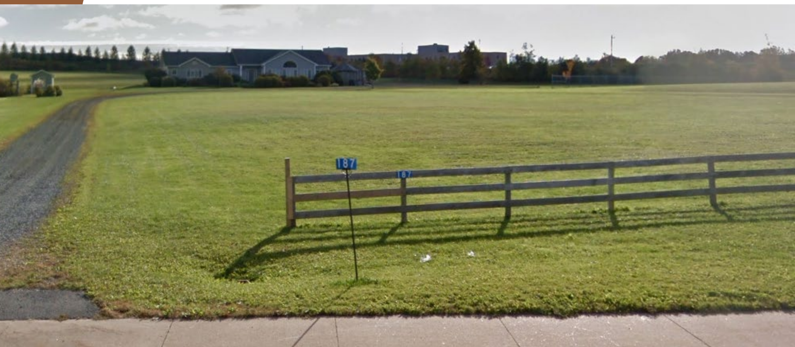
View of existing building from Payzant Drive